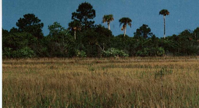
The Loxahatchee Slough is a Rural Area of the City located in the Western Section of the City.