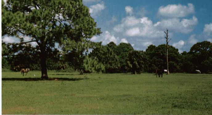
Rural Area of the City at Hood Road and Interstate 95 in Palm Beach Gardens