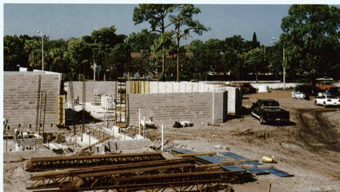
The City of Palm Beach Gardens prepares for its continued growth by constructing a new City Hall and Police Station and making additions and renovations to the main Fire Station and Gardens Park.

Urban Growth Boundary = Loxahatchee Slough ecosystem.